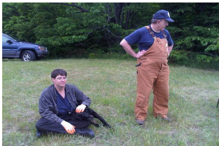
Balun? We don't need no stinkin balun!